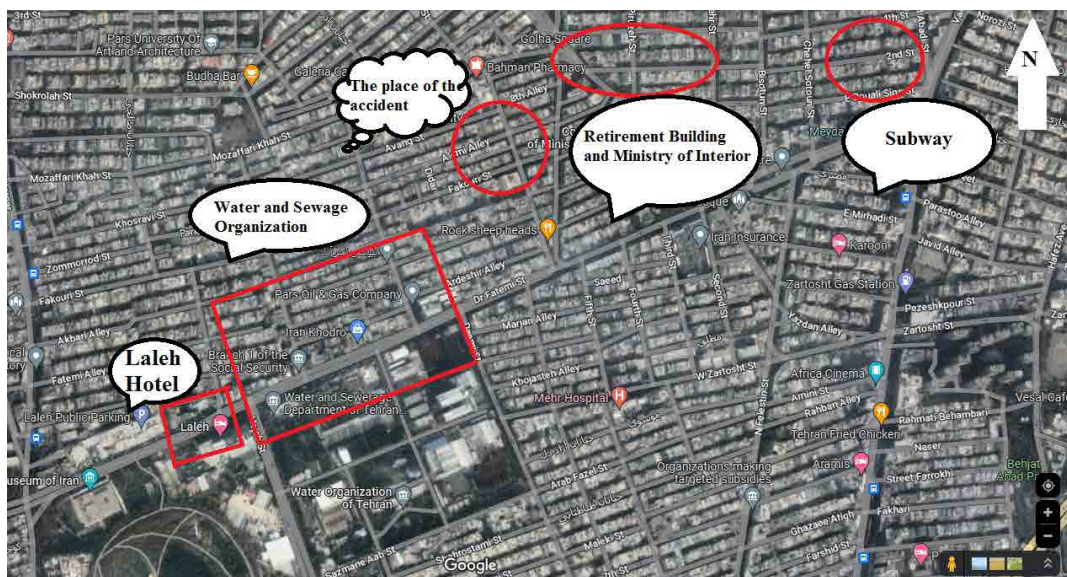
Figure 1. Critical places and buildings in the vicinity of the scenario

Figure 1 shows the critical places and buildings in the vicinity of the scenario: